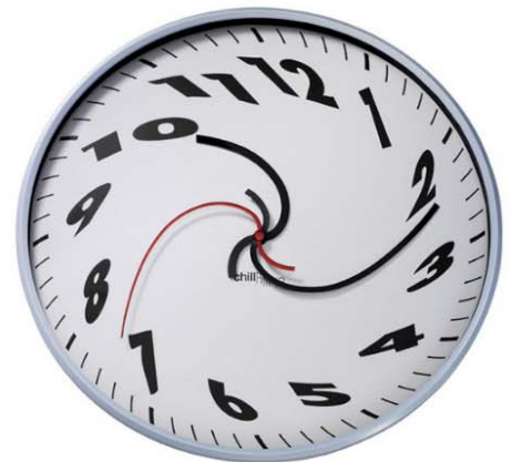
School 4 days a week (longer days - 10 hours)